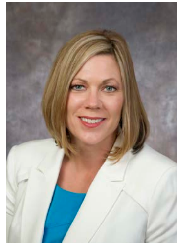
Rochelle Squires Minister of Sustainable Development

A handwritten signature in black ink, appearing to read "R. Squires".