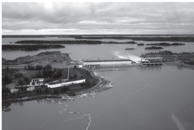
Jenpeg Generating Station