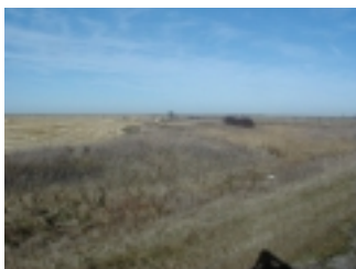
Vegetated buffer strip.

Lands immediately adjacent to surface water or watercourses are at an elevated risk of contributing phosphorus simply due to their physical proximity. The following practices are suggested for reducing transfer of manure and manure phosphorus to surface waters. These include the establishment and/or maintenance of vegetated buffer strips and setback restrictions on manure application to adjacent land. No manure should be applied to the permanently vegetated buffer strips.