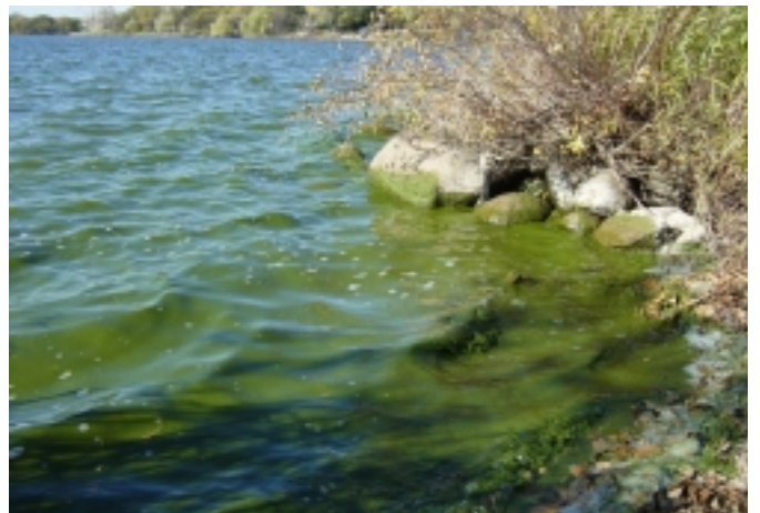
The impact of excess phosphorus manifests itself in algae blooms.

The impact of excess phosphorus on surface waters is the deterioration of surface water quality. This manifests itself in algae blooms frequently seen on water bodies in Manitoba ranging from potholes and small lakes to large water bodies such as Lake Winnipeg.