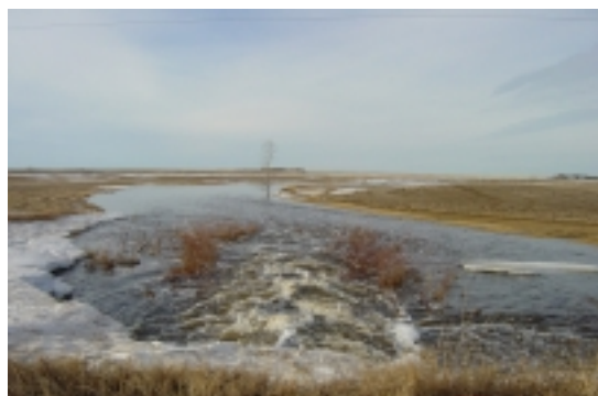
A better understanding of the importance of snowmelt and flooding events in phosphorus loss is required.

In April 2003, the MPEC sponsored the Agricultural Phosphorus Update 2003 Symposium. International experts on phosphorus processes were invited to share their views and knowledge on environmental phosphorus, and on the effectiveness of beneficial management practices and regulatory approaches.