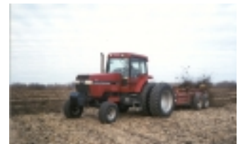
Manure may be inadvertently spread into adjacent ditches or water courses.

Direct deposition of manure is the direct application of nutrients into a ditch or water course. This may happen when manure or fertilizer is inadvertently spread into adjacent drainage ditches or watercourses, or by tillage equipment operating too near, or in, ditches. Phosphorus in manure can be deposited directly into water by livestock with direct access to the watercourse.