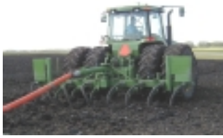
Injection or incorporation of manure is most critical in the fall on regularly inundated lands.

Large livestock operations are already prohibited from land-applying manure during the winter. The prohibition should be extended to include all sizes of operations that spread manure on regularly inundated lands. This should significantly reduce the direct transfer of manure to surface waters from frozen and snow-covered soils. However, an immediate prohibition on winter spreading will have severe financial impact on many existing small poultry and livestock operations that currently lack the capacity to store manure over winter. Significant financial assistance and phasing-in of this prohibition will be required in order for these operations to comply.