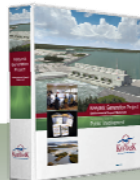
Public Involvement (1 Binder)