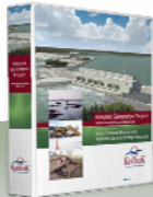
Socio-Economic Environment, Resource Use and Heritage Resources (1 Binder)