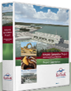
Project Description (1 Binder)