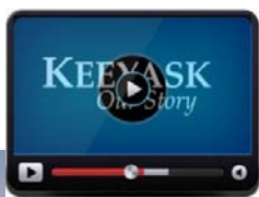
Keeyask: Our Story Video