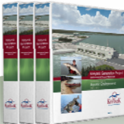
Aquatic Environment (3 Binders)