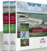
Terrestrial Environment (2 Binders)