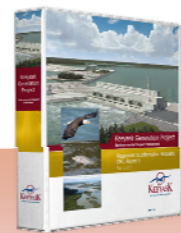
Responses to Information Requests