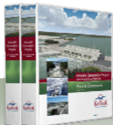
Physical Environment (2 Binders)