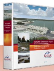
Preliminary Environmental Protection Program