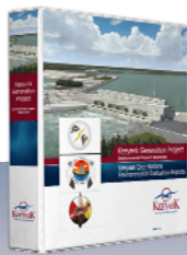
The Keeyask Cree Nations Evaluations

Cree Nation Partners, York Factory First Nation, Fox Lake Cree Nation,