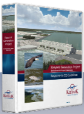
Full Response to the EIS Guidelines